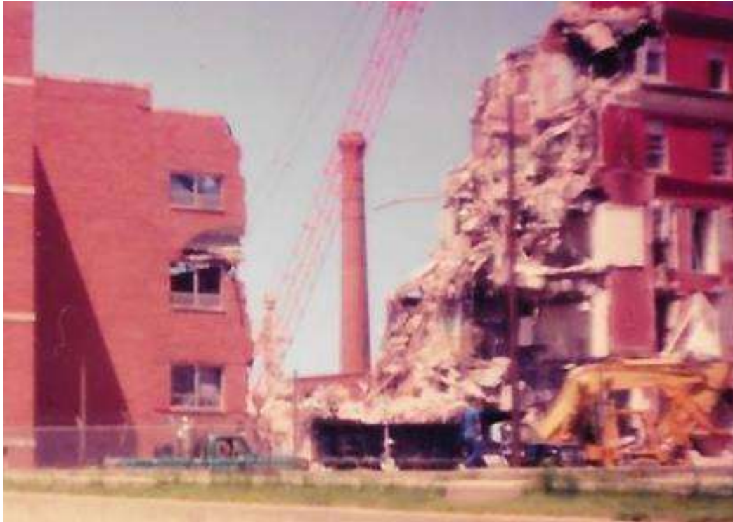
Demolitions in St. Joseph