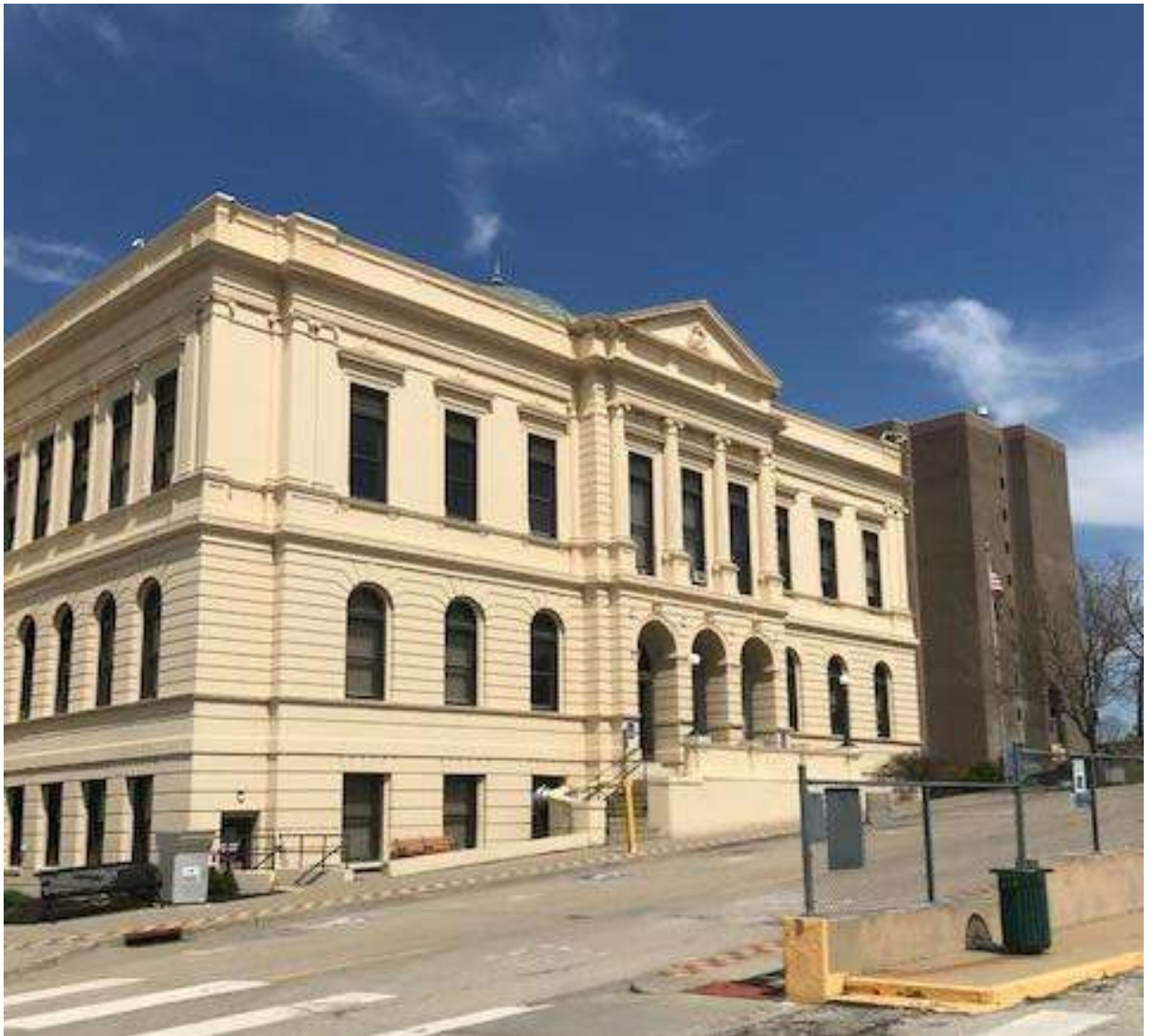
Downtown Public Library, St. Joseph, MO