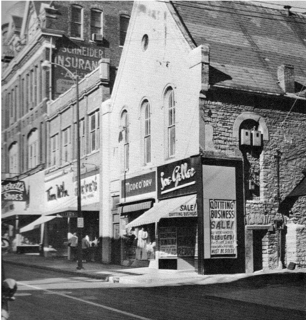
Examples of adaptive reuse of historic structures in St. Joseph

In the mid-20 th century, the concept of adaptive reuse came to the forefront of preservation thought – reuse what we have rather than demolish and rebuild. Preservation was seen to have a role in supporting social values. Today, one of those key values is sustainability. Again quoting Richard Moe, “Because it necessarily involves the conservation of energy and natural resources, historic preservation has always been the greenest of the building arts.”