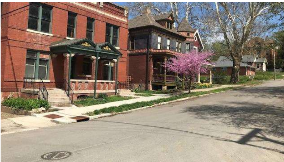
A street in Museum Hill

Heritage neighborhoods tend to be much more dense in occupation, the yards are smaller, and they were designed to be walkable to amenities such as groceries. The preservation and revitalization of these neighborhoods with their historic streetscapes is an important step toward creating a more sustainable community. Preservation and adaptive reuse of individual buildings nearly always provides energy savings and environmental benefits over demolition and new construction. The preservation of our historic neighborhoods offer similar benefits as this promotes the reuse of already existing infrastructure and supports districts that tend to be walkable thus resulting in energy savings and improved community livability.